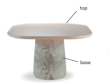
POPPY dinner table