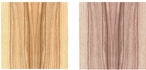
Natural olive ash Nude olive ash