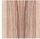
Nude olive ash