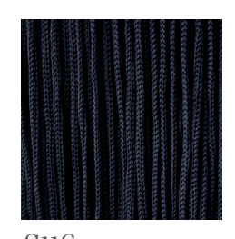
S116 Suggested match: Lapis Lazuli, Mediterranee