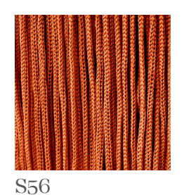
Suggested match: Papaye