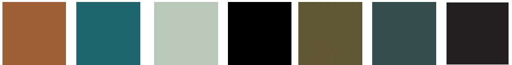
Camel Teal Jade Kaki Mocha Olive Black