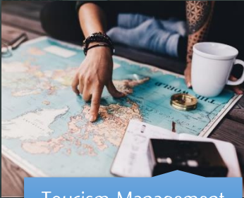
Tourism Management [PT]