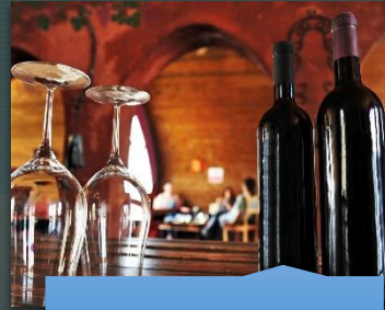
F&B Management [EN]