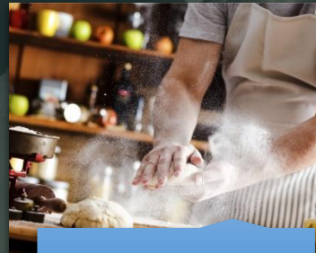
Pastry Arts [PT]