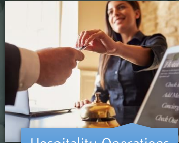
Hospitality Operations Management [PT]