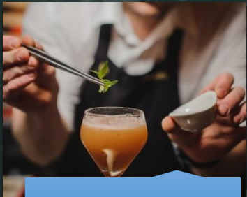
F&B Management [PT]