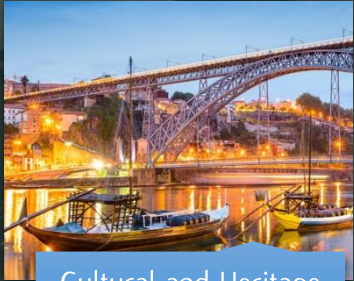
Cultural and Heritage Tourism [PT]