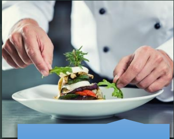
Culinary Arts [EN]