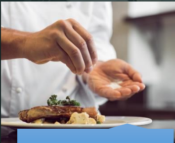
Culinary Arts [PT]