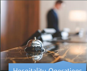
Hospitality Operations Management [EN]